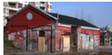
Gas Works Heritage Building can be adapted as a public building to support a variety of new community programs

At the centre of the community will be the Gas Works View Park, with the potential to showcase the historic Gas Works community building with active arts and cultural activities. The Queens Avenue Greenway; which runs along Third Avenue, will connect this local park with the waterfront. In the longer term, a pedestrian bridge may be considered at the Third Avenue and Stewardson Way intersections. Residents in the Lower Twelfth neighbourhood will feel connected at the centre of the Region with all the conveniences just steps away from their homes.